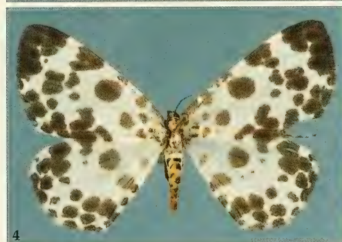
Figs 2-4. Inouea cyclobalia (West), Luzon. 2-3. ♂, 4. ♀.

♀ with ground colour white, pattern similar to ♂, but cell spots larger, more rounded, present also on hindwing, forewing spot below cell larger, rounded, medial spot of postmedial line larger. Colouration of body and palpi similar to that of ♂, frons yellow with two lateral black spots. One examined ♀ with black markings reduced, thus terminal and subterminal rows of spots better separated.